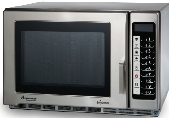
Model RFS18TS shown