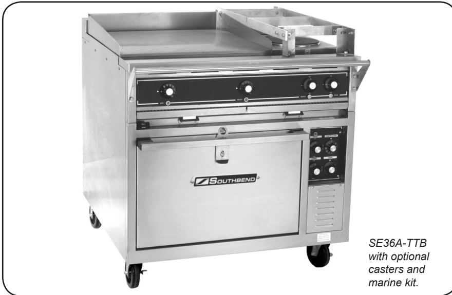
SE36A-TTB with optional casters and marine kit.