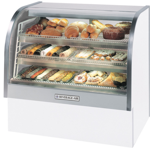
CDD4 (shown with optional third shelf)